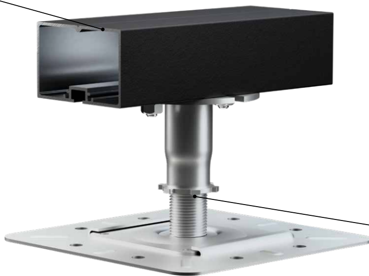
ECO 50 JOIST